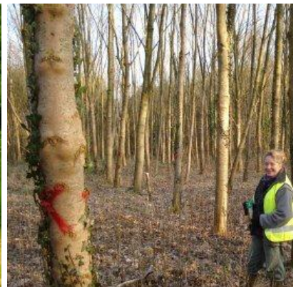
selection of trees for thinning