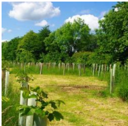
planning a new woodland