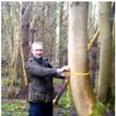
Forest Commission plans