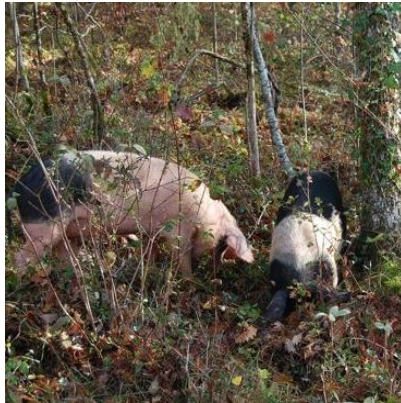
things to do with your woodland