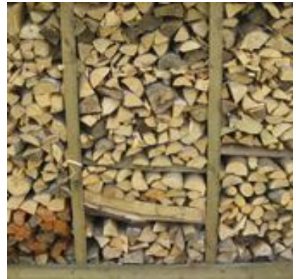
wood as fuel

What experience do you want? click a word