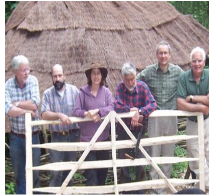
splitting wood for fencing