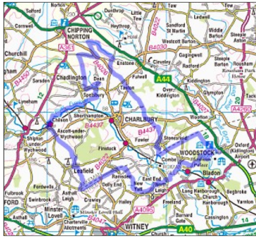
The Wychwood Way