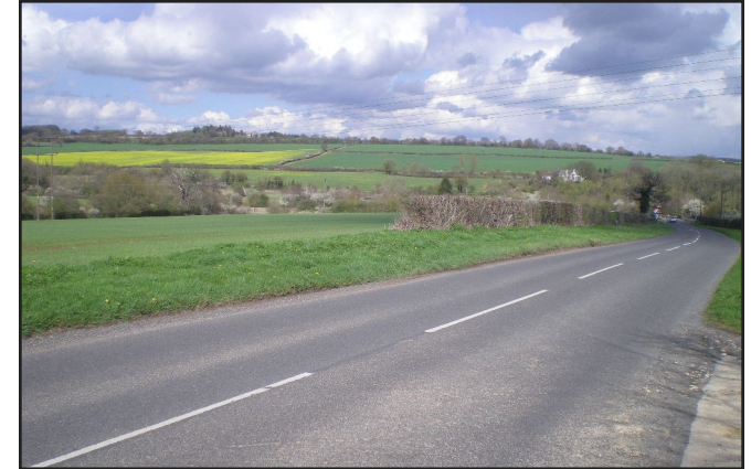
View towards Finstock Railway Station

Part of a series of circular walks that link in with The Wychwood Way