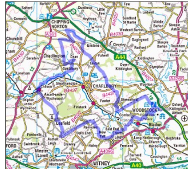
The Wychwood Way

2 miles north of North Leigh; 10 miles west of Oxford, off the A4095.