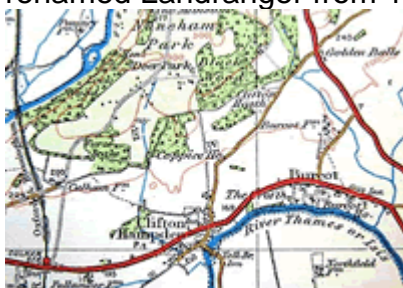
Ordnance Survey one inch popular ed. - Oxford & district (1921)

Metric replacement for the old 1" maps - First Series, 1974-6; Second Series (1974-) renamed Landranger from 1979.