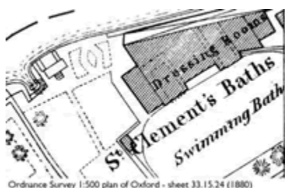
Ordnance Survey 1:500 plan of Oxford - sheet 33.15.24 (1880)

As part of the OS County Series mapping, only towns with a population of over 4,000 were surveyed at this generous scale; in Oxfordshire, that meant Abingdon, Banbury, Henley and Oxford only (1873-82). These are immensely useful to historians as the detail of buildings and street furniture is quite stunning. The town plan scale was never revised beyond this first edition of 1873-82.