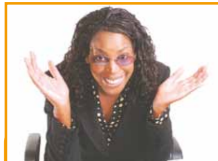
Your support worker or carer

Anyone can contact the Learning Disability Teams for help or advice. It could be one of these people: