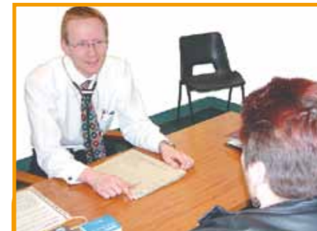
Your Doctor (GP) or Community Nurse