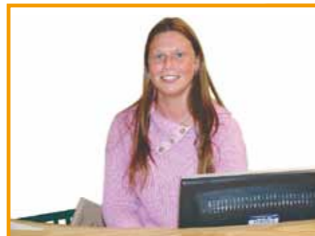
Somebody you know at Day Services